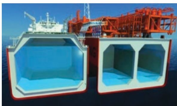
DUAL STORAGE TANK DESIGN VS SINGLE ROW TANK DESIGN

A key design requirement has been to minimise motions as far as practicable to minimise the effects on people