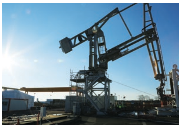
PRELUDE FLNG LOADING ARMS UNDERGOING FACTORY ACCEPTANCE TESTING IN SENS, FRANCE.

After construction was complete on the first Prelude FLNG loading arm, its full capabilities were tested. This involved simulating the actual movement of both the loading arm and the receiving arm of an LNG carrier and nitrogen (which simulated the extreme cold of LNG) was transferred between the two safely. The testing was a success and the design performed as expected.