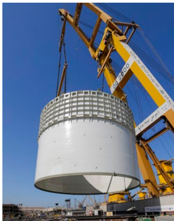
A MODULE OF THE PRELUDE FLNG TURRET MOORING SYSTEM UNDER CONSTRUCTION

The turret's swivel design enables the facility to 'weather vane' whilst the mooring lines remain fixed to the sea floor. This feature enables the facility to rotate according to weather and sea conditions. The ability to weather vane matched with the facility's sheer size and weight creates stability and ensures safe and effective offloading can take place at sea. This is further supported by dynamic thrusters which can 'hold' the facility in the optimum position for berthing and offloading.